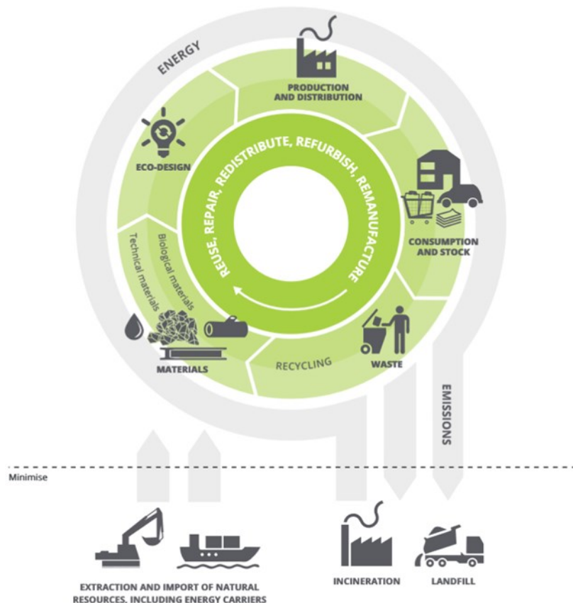
Image 18.1: A Simplified Model of the Circular Economy for Materials and Energy (European Environment Agency (EEA) 2016)

The principal objective of sustainable resource and waste management is to use resources more efficiently, where the value of products, material and resources is maintained in the economy for as long as possible such that the generation of waste is minimised. To achieve resource efficiency there is a need to move from a traditional linear economy to a circular economy (refer to Image 18.1).